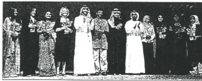
Winners all Sheikh Abaulah and Sheikh Maktoum bin Mohammed with the winners of the 3rd Ibd'a Media Student Awards 2003.

He added: "Through Ibd'a's, DMC is trying to recognise and foster young talent by tapping its wellsprings in the universities and media schools of our region. The amazing diversity and intensity of talent that the awards have attracted this year gives us the energy to further