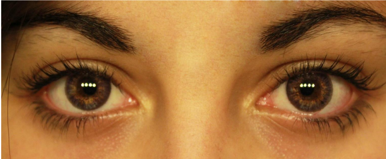
Fig. 1. Marianna Destaraca. Eyes . 2011. Photograph. Archives of American Art, Smithsonian Institution, Washington, DC. Flickr Commons . Yahoo! Inc.. Web. 09 May. 2017. Digital Image.