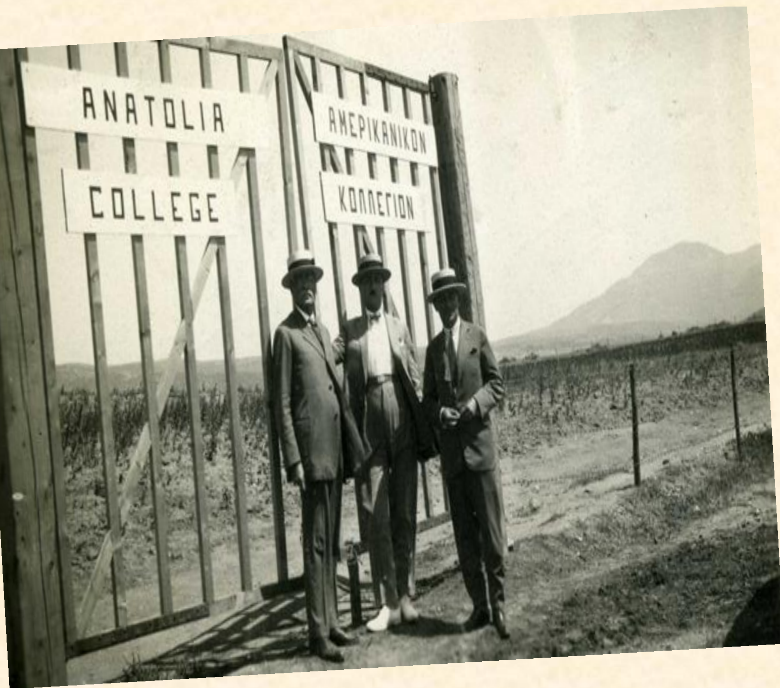
Anatolia College Main Gate, 1928. President George White with two other gentlemen standing before the new gate. In 1928 the fencing for the new Anatolia College was constructed on the current site between Pylea and Panorama.

The archival photos are available at http://dspace.act.edu/jspui/