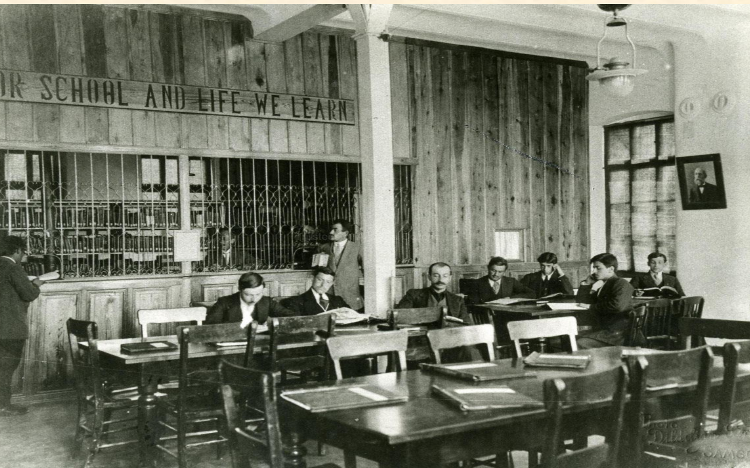
The Merzifon Campus Library, 1890 Studying area and reference desk with stacks