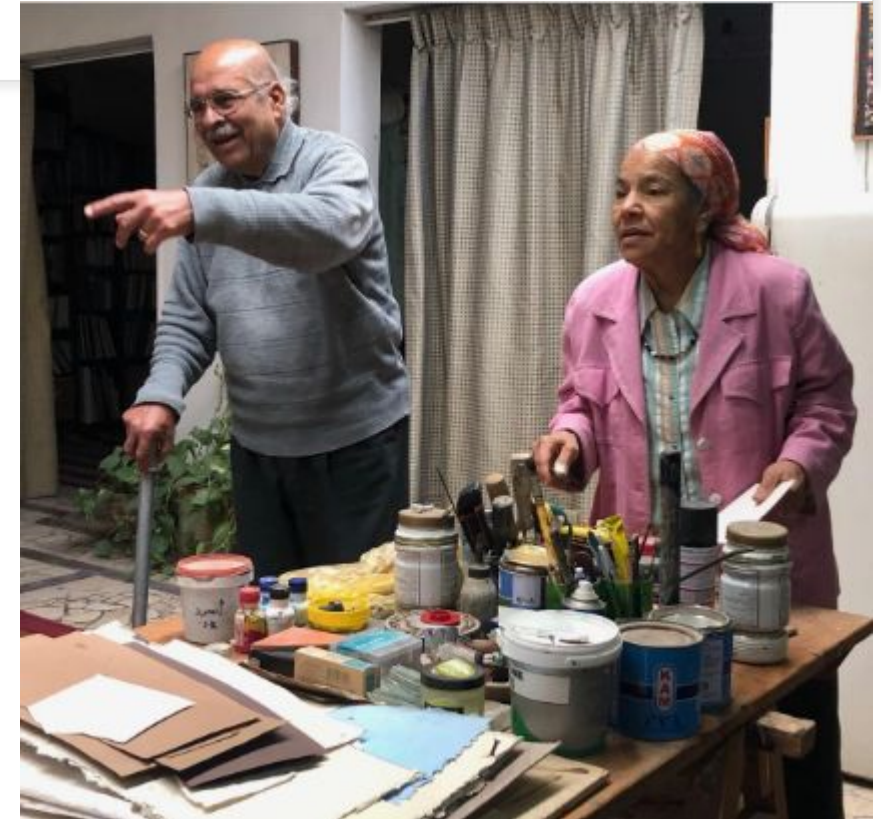
Project Interviewees at studio